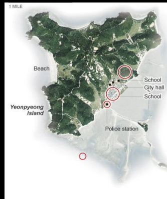
NY Times Graphic

http://www.boston.com/bigpicture/2010/11/tension_in_the_koreas.html