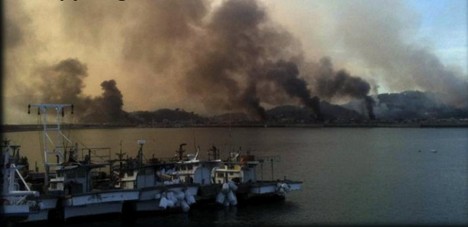
Yeonpyeong Island After Attack: Nov. 23, 2010