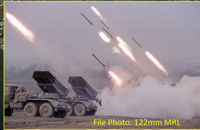
File Photo: 122mm MRL